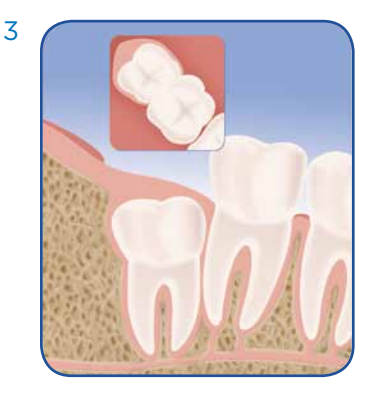
An incision is made and overlying soft tissue and bone are removed exposing the crown of the impacted tooth.