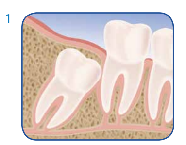
Angular, bony impaction of third molar (wisdom tooth)