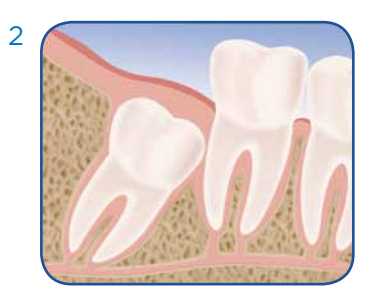
Soft tissue impaction of third molar.